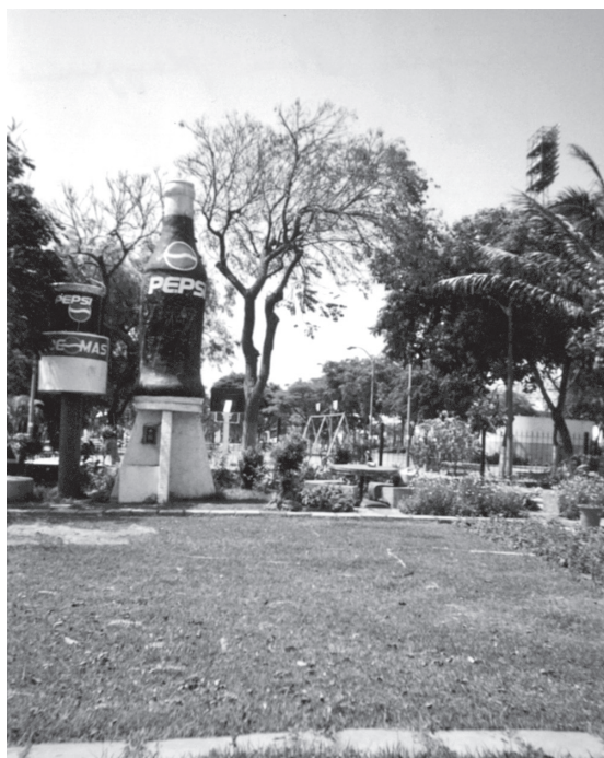
Pepsi bottle in Peru. The commercialization of American products accompanied the spread of sport.

Such lessons were first enacted as early as 1879 when the U.S. government opened the first of many residential schools for the children of the defeated American Indian tribes. At the schools Indians were forced to adopt white, Anglo norms by cutting their long hair, speaking English, learning the white sport forms, and developing vocational skills that would prepare them for jobs in the capitalist workforce. American Protestant missionaries had adopted similar strategies in the Hawaiian Islands as early as the 1840s, where they initiated residential schools and introduced the students to the Ame-