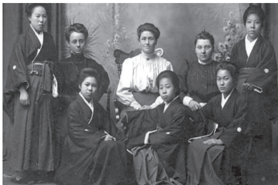
Protestant missionaries taught American cultural values to their Japanese students (Photo: From Dean C. Worcester, "The Non-Christian Peoples of the Philippine Islands," National Geographic , 24: 11 (November 1913), pp. 1252, 1255).

American merchants and plantation owners had organized a successful coup against the Hawaiian monarchy in 1893, supported by the U.S. diplomat and a contingent of marines. The United States formally annexed the territory in 1898 during the Spanish-American War. Sport served as a means of social control among a polyglot labor force that included Chinese, Japanese, Portuguese, Filipino, and native Hawaiian residents, as well as military units comprised of African Americans. Plantation owners organized baseball leagues as a means to provide wholesome recreation as an alternative to drinking and to insure productive workers. The baseball leagues in Honolulu included the African American teams and offered an experiment in racial integration long before such opportunities reached the mainland. Moreover, the conscription of