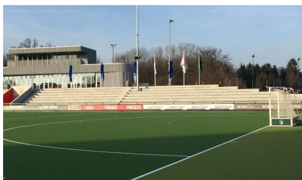
HC Oranje-Rood, Gennep Sportparken