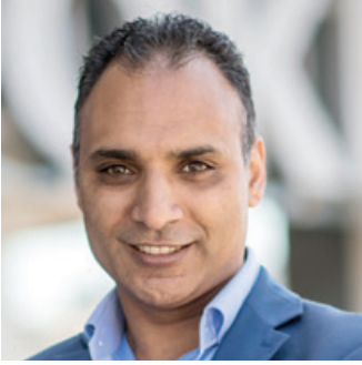
Rabih Azad-Ahmad Cultural Mayor, Department of Culture and Citizens' Services, City of Aarhus