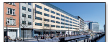
CABINN AARHUS ** Kannikegade 14 • 8000 Aarhus C