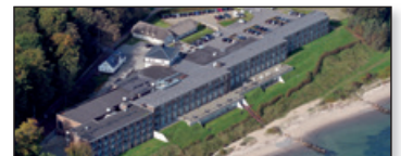
MARSELIS HOTEL - AARHUS **** Strandvejen 25 • 8000 Aarhus C