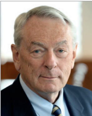
Richard W. Pound

Richard W. Pound , former WADA president, member of the IOC and head of the WADA committee assigned to investigate the allegations against the IAAF and Russia is a regular visitor at Play the Game conferences. In 2013 Play the Game gave him the Play the Game Award for his willingness to engage in difficult discussions about issues in sports governance as well as in the anti-doping work.