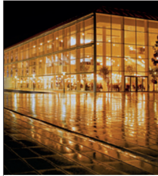
RECEPTION - SUNDAY 25.10 AARHUS CONCERT HALL Thomas Jensens Allé • 8000 Aarhus C