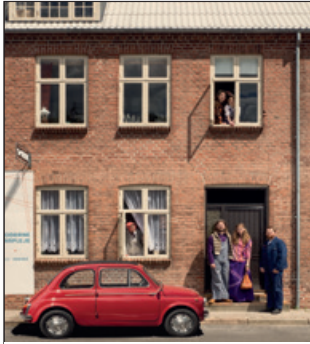
EXCURSION - MONDAY 26.10 DEN GAMLE BY Viborgvej 2 • 8000 Aarhus C