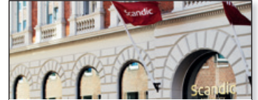
HOTEL SCANDIC CITY **** Østergade 10 • 8000 Aarhus C