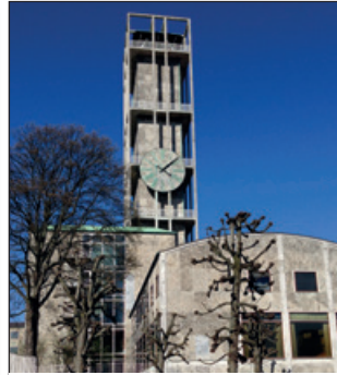
OPENING - SUNDAY 25.10 AARHUS CITY HALL Rådhuspladsen 2 • 8000 Aarhus C